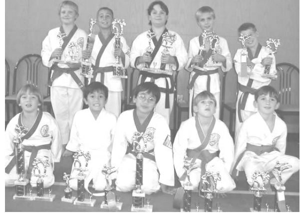
You are a winner when you decide to compete.